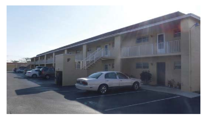
Front (Left) Front (Right)